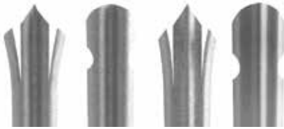
WTP W Section Triple Pointed WRN W Section Rounded Notched DTP D Section Triple Pointed DRN D Section Rounded Notched

Factories - Schools - Heavy Industrial - Airports - Prisons